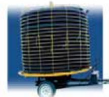
MAXI STRINGER TRAILERS