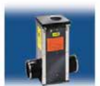
AGRI DRAIN PRODUCTS

WWW.PRINSCO.COM | AGBLOG.PRINSCO.COM | 800.992.1725