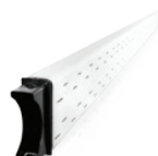
PROFORM HD® FORM DRAIN VENT