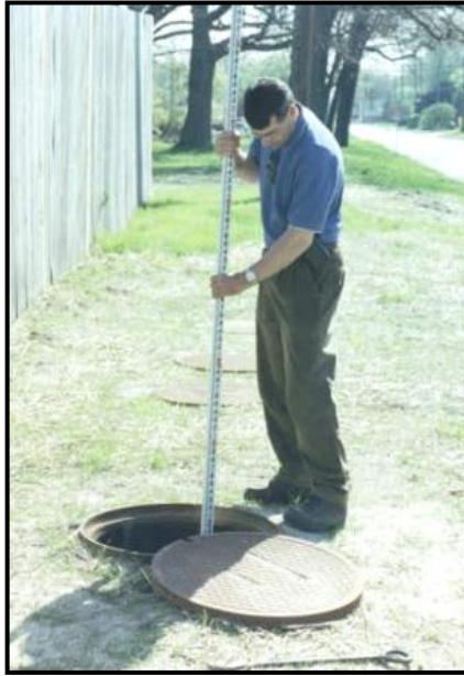
Sediment inspection using a stadia rod