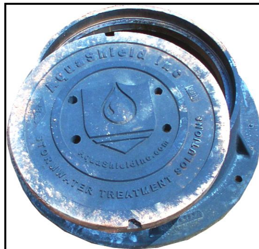
Aqua-Swirl ® manhole cover

In order to ensure that our systems are being maintained properly, AquaShield ™ offers a maintenance solution to all of our customers. We will arrange to have maintenance performed.