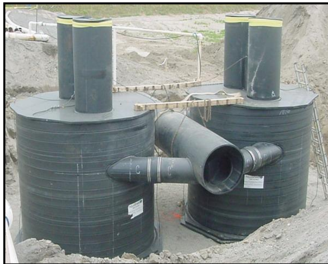
Custom designed AS-9 Twin Aqua-Swirl ®

The Aqua-Swirl ® system can be modified to fit a variety of purposes in the field, and the angles for inlet and outlet lines can be modified to fit most applications. The photo below demonstrates the flexibility of Aqua-Swirl ® installations using a “twin” configuration in order to double the water quality treatment capacity. Two Aqua-Swirl ® units were placed side by side in order to treat a high volume of water while occupying a small amount of space.