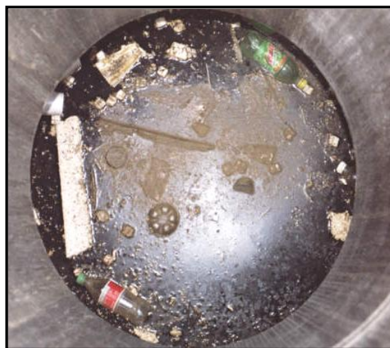
Floatable debris in the Aqua-Swirl ®