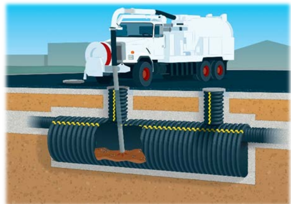
Figure 2: Vacuum Truck with Hose

If the system reaches a sediment height greater than 20 percent of the pipe diameter, the system should be clean at the soonest opportunity.