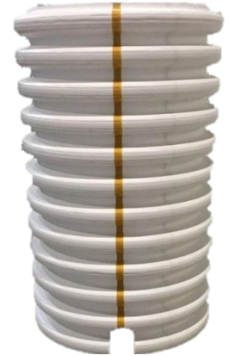
Figure 1: Prinsco Meter Pits

Prinsco Meter Pits provide protection and ease of access for gas/water meters in residential and commercial applications. Made from high density polyethylene, meter pits are non-corrosive, crack resistant, and have a 75-year service life. While installation practices may vary per project, this document highlights Prinsco’s recommended application procedures for Meter Pit installation.